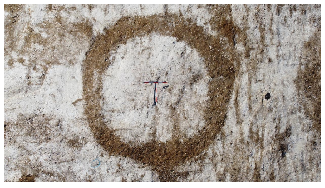
Plate 5. View of the NE ring ditch