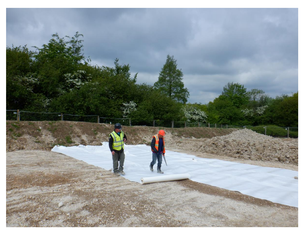
Plate 6. View of membrane cover (looking west)