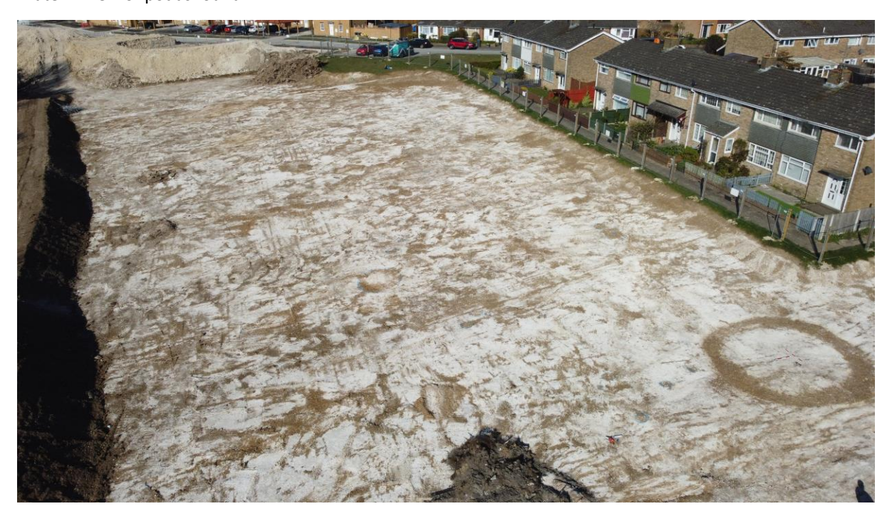
Plate 3. View of site (looking NNE)