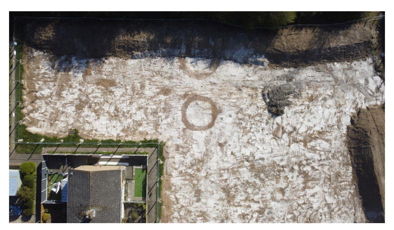
Plate 4. View of the two ring ditches