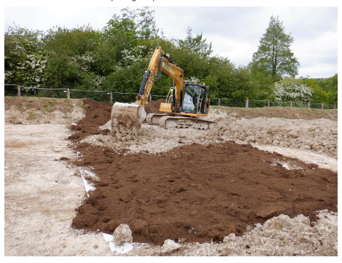
Plate 7. View of topsoil and chalk cover (looking west)