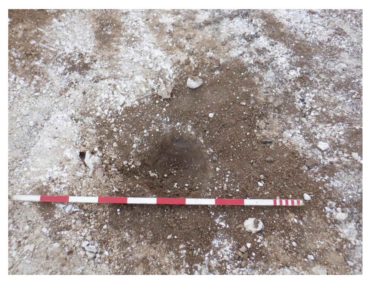
Plate 2. View of pot as found