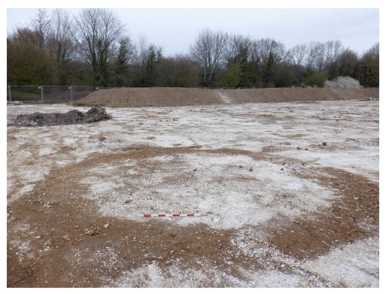
Plate 1. View of the site (looking north)